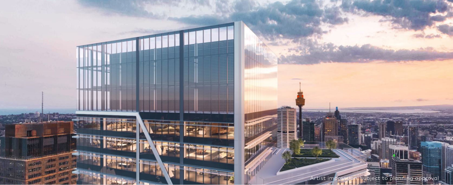
Artist impression, subject to planning approval