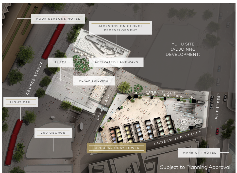
Subject to Planning Approval

The redevelopment of the LLCQ site will deliver a new sustainable commercial tower and additional low scale buildings. At the heart of the project is a new public plaza, Plaza Building and network of lanes that will deliver new civic and public spaces for residents, visitors and workers, enhancing the quality of the area. The redevelopment will add interest and grain to the precinct and contribute to a livelier and more engaging city. It delivers a new commercial office building to support Sydney's economic development and a series of public assets that will have a positive impact on the social fabric of Sydney.