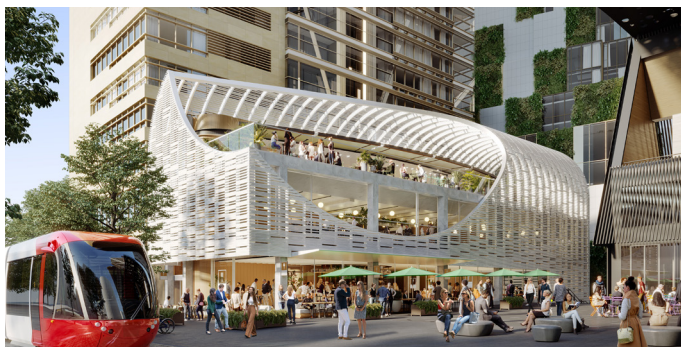
Artist impression of Jacksons on George

Designed by local, award-winning architects Studio Hollenstein, Jacksons on George draws its inspiration from the rich history of the site. The form of the building