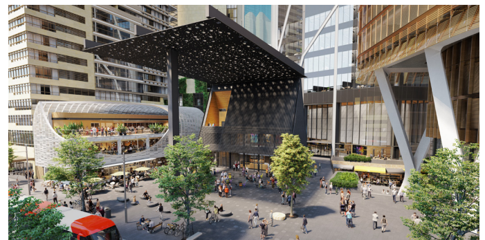
Artist impression of Jacksons on George and the plaza connecting to George Street