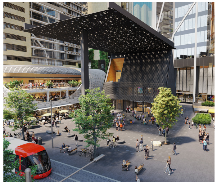
Artist Impression of the plaza and connection to George Street