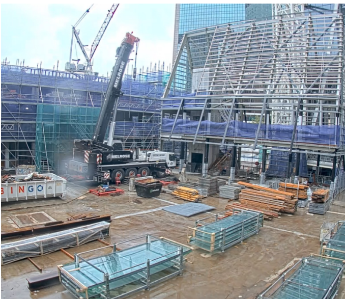
The Plaza Building and plaza construction progress in March 2022