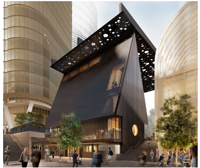
Artist Impression of the completed building