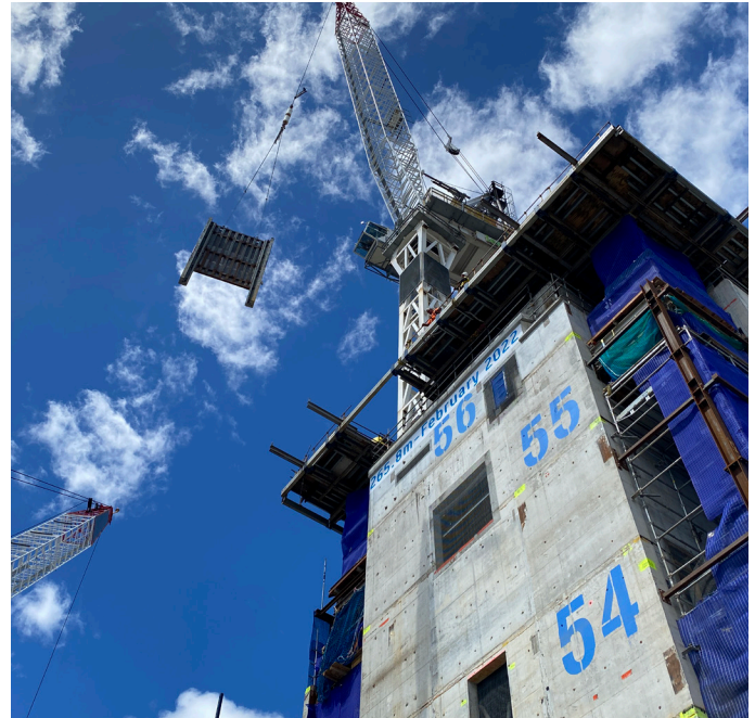
Salesforce Tower Sydney core reaches its peak of 265.8m in February 2022

Works are progressing with internal fit out works well underway and around 3/4 of the façade panels have been installed. The tower, located on George Street within Sydney Place, is targeting completion around Quarter Three this year.